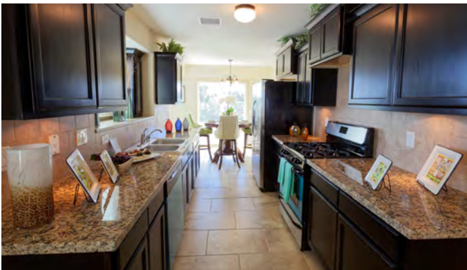
Kitchen & Breakfast Nook

This Spanish Colonial Home is part of our Saratoga Earth Series. All of our Saratoga Earth Homes are environmentally friendly and energy star certified. Each home features solar panels at no additional cost plus standard luxury amenities such as gorgeous custom designer kitchen with granite counter tops, full kitchen stainless steel appliances and ceramic tile throughout kitchen, living room and bathrooms. Indulge in comfort and create new memories while living the American Dream. From our family to yours, Welcome Home!