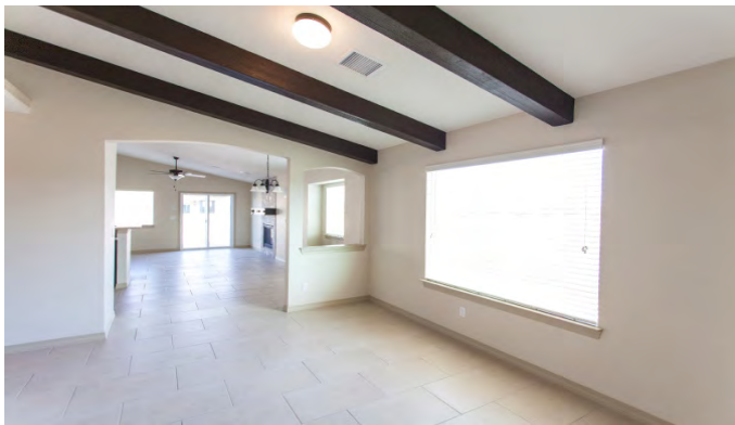
Living Room, Dining Room, Second Living Room

This Spanish Colonial Home is part of our Saratoga Earth Series. All of our Saratoga Earth Homes are environmentally friendly and energy star certified. Each home features solar panels at no additional cost plus standard luxury amenities such as gorgeous custom designer kitchen with granite counter tops, full kitchen stainless steel appliances and ceramic tile throughout kitchen, living room and bathrooms. Indulge in comfort and create new memories while living the American Dream. From our family to yours, Welcome Home!